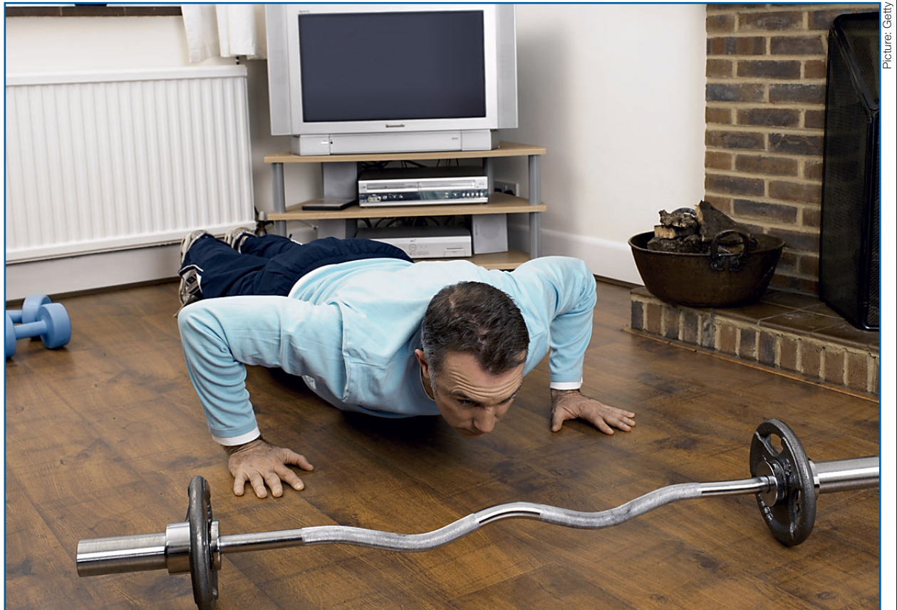
Extracise: The latest trend is to link music and vision throughout the home so you can work out in any room